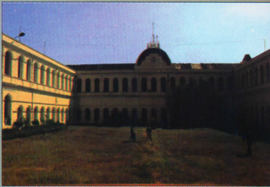
Maharaja's College Interior View